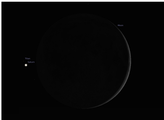
Saturn Before Occultation

Look south, 196° and 26° up for Neptune, a blue dot. Neptune is 4.4 billion km away.