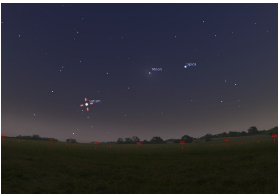
10pm Saturn's position in the night sky

By 12:20am it will have risen to nearly its maximum height ( 20^\circ above the horizon) before again descending towards the horizon. If you have a telescope it's truly a jaw dropping sight, you may even see Dione, Tethys, Enceladus, Rhea and Titan, just some of Saturn's many moons.