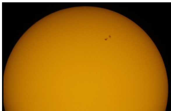
Sun spots seen through a telescope