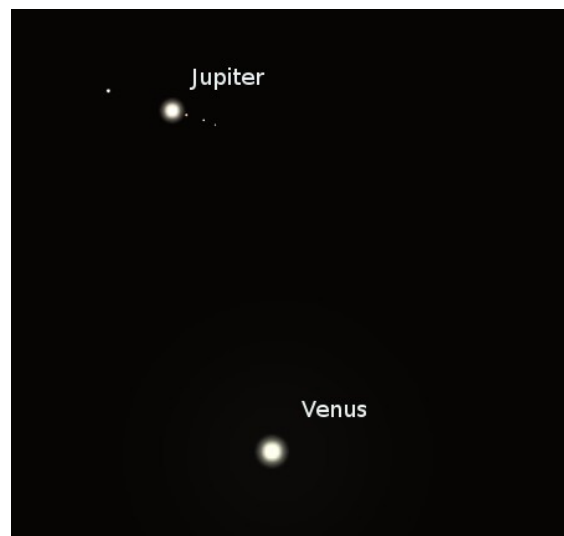
Close up of Jupiter (its moons) and Venus

At about 10:30pm look North at Azimuth 285° on your compass and just above the horizon at Altitude 6° and you will see Jupiter and Venus very close together. If you recognise the constellation Leo (the Lion) then you will find the planets just about to be eaten by Leo.